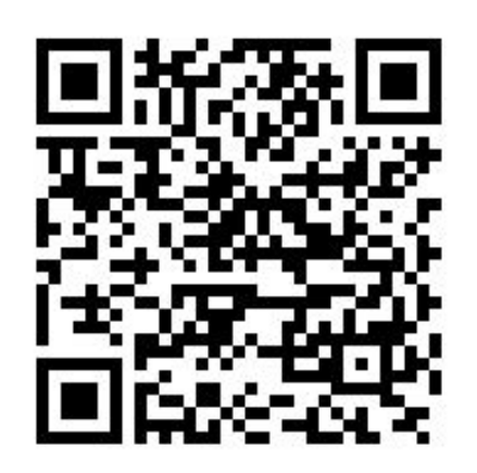
Kids story builder (android)